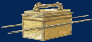
Ark of the Covenant