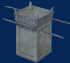
Altar of Incense