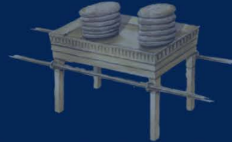
Table of Showbread