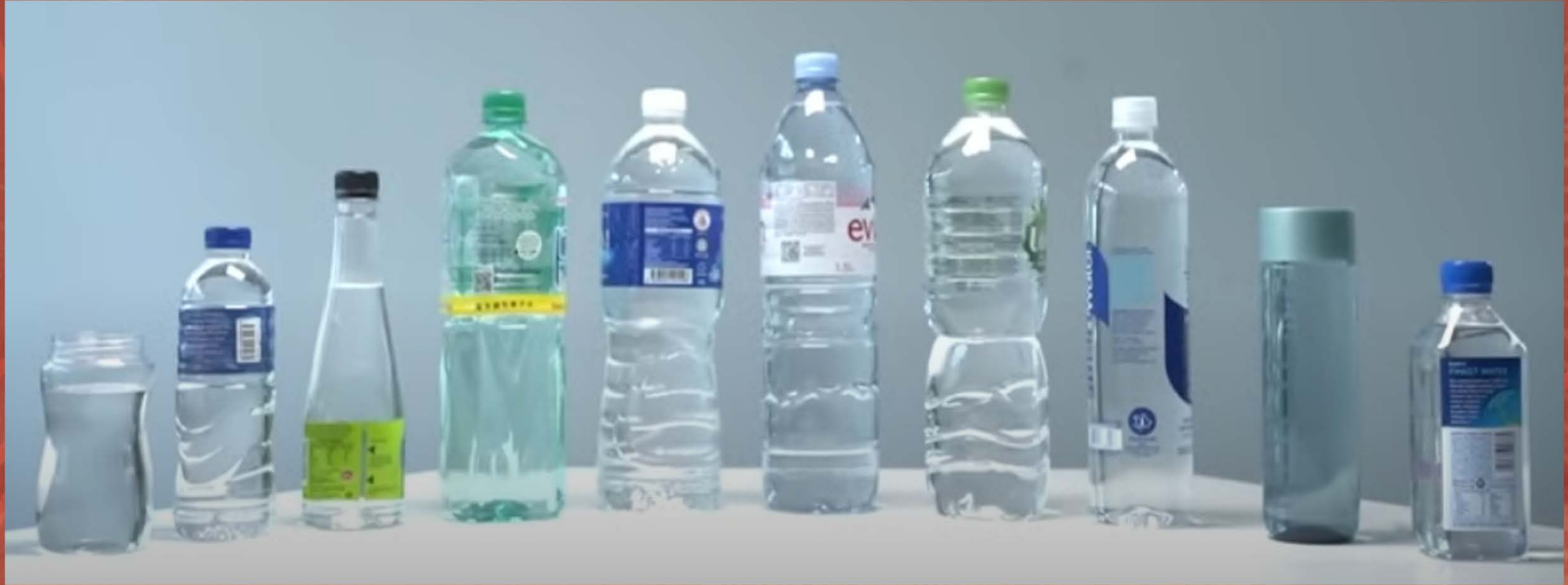
Extract: CNA Insider Is Bottled Water Worth Your Money? | Talking Point