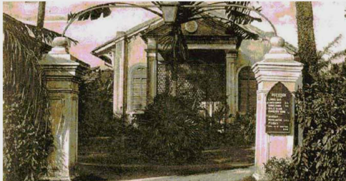
The first local Brethren Chapel at Bras Basah Road was built in 1866. Dr Benjamin Sheares, the second President of Singapore, was baptised at this church. It has since been relocated and is now called Bethesda Hall (Ang Mo Kio). circa 1800s.